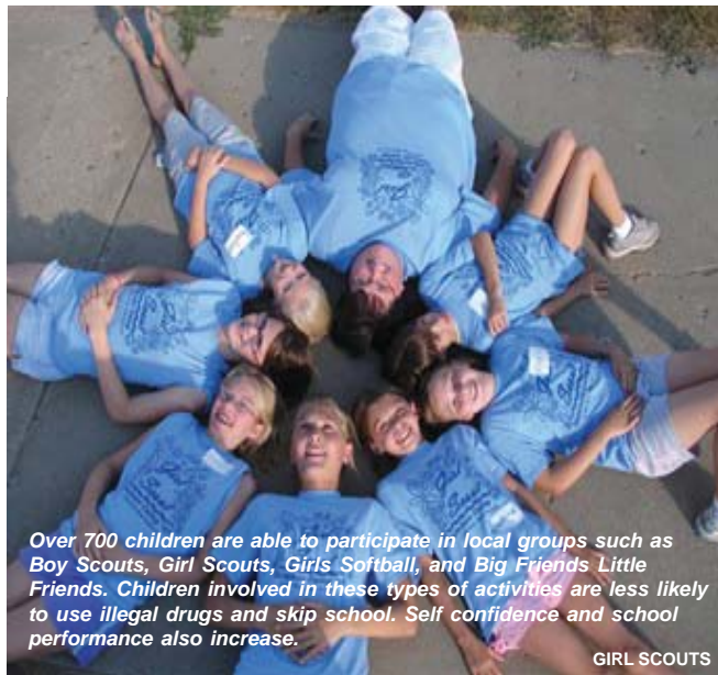
Over 700 children are able to participate in local groups such as Boy Scouts, Girl Scouts, Girls Softball, and Big Friends Little Friends. Children involved in these types of activities are less likely to use illegal drugs and skip school. Self confidence and school performance also increase.