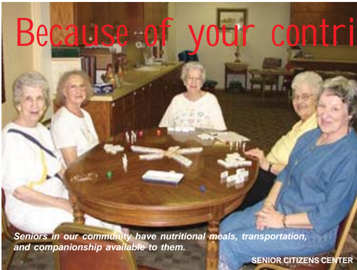
Seniors in our community have nutritional meals, transportation, and companionship available to them.