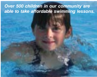
Over 500 children in our community are able to take affordable swimming lessons.