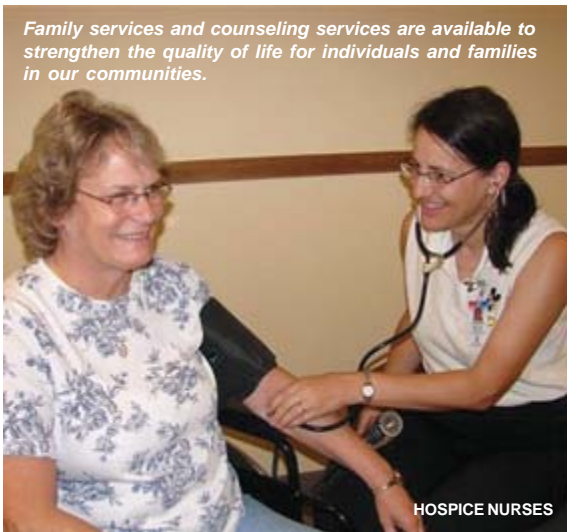
Family services and counseling services are available to strengthen the quality of life for individuals and families in our communities.